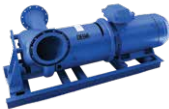
DESMI NSL Horizontal