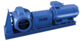
DESMI DSL Horizontal