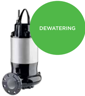
HOMA Submersible wastewater pumps