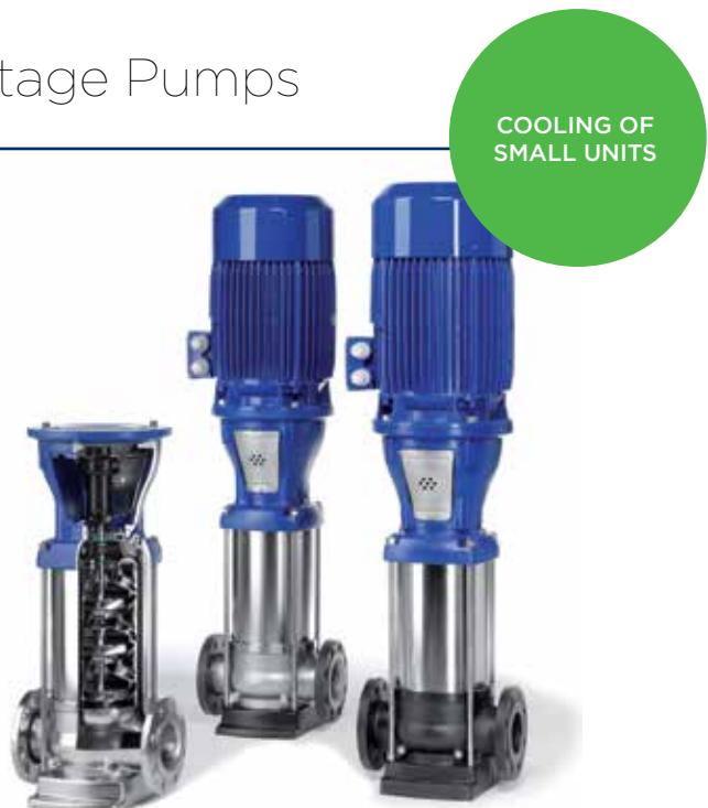
DESMI DPV Pumps