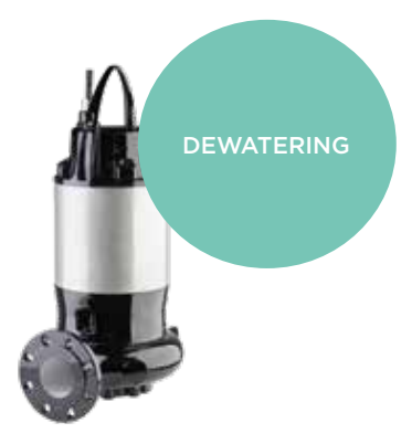
HOMA Submersible wastewater pumps